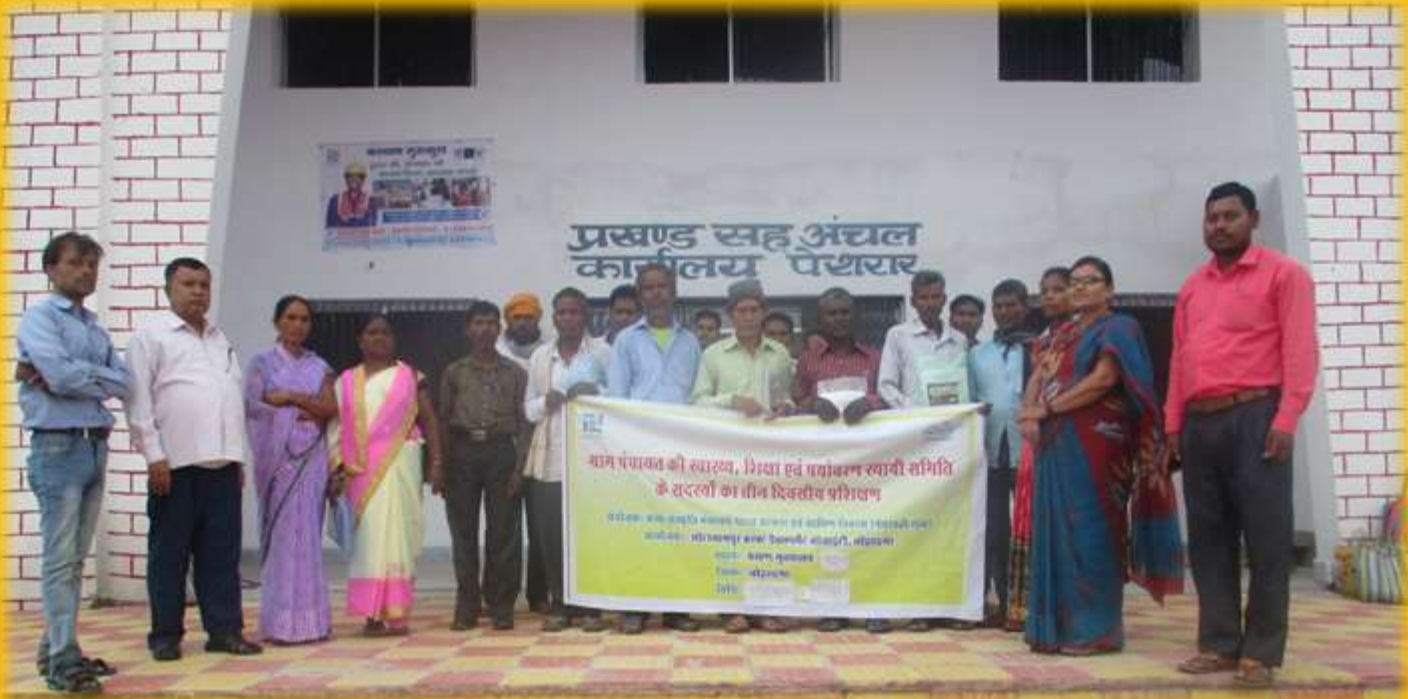
CCDS was one of the Implementing agencies for Training program of Garam Samitee Members on Swatchh Bharat Mission ( Sanitation, health and education) for 7 blocks of Lohardaga district.